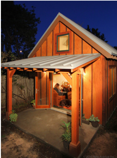
A second unit can be a small stand-alone cottage that provides low-cost rental housing stock.

One such strategy is small-scale infill—specifically, the construction of self-contained, smaller second units on the lots of existing homes. These units can be either attached to the primary house, such as an above-the-garage or basement unit, or a free-standing cottage or carriage-house. The Institute of Urban & Regional Development’s Center for Community Innovation is assessing both the social and individual benefits of second units as well as their potential to accommodate future housing needs in the East Bay.